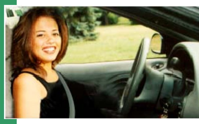
What you need to know about the JOL Law